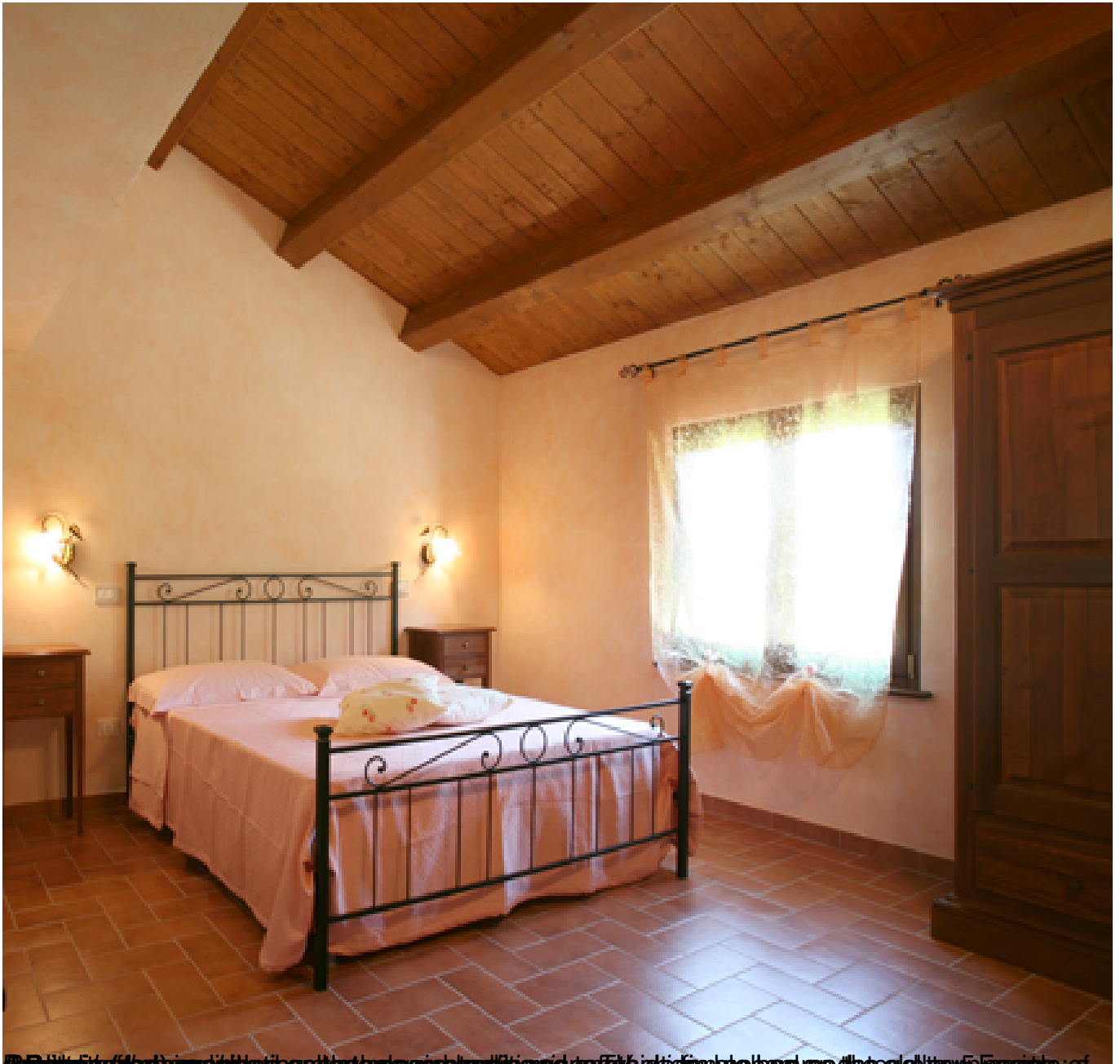
Bedroom (Bedroom) with a double bed, a black metal frame, and a large window. The room is decorated with a wooden ceiling, a wooden floor, and a wooden wardrobe. The room is suitable for a family of 2 people.